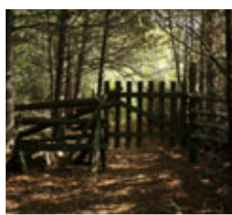
Actual photos of Avonlea Woods Trail, Cedar Fence Trail, Avonlea Park and trail gates.