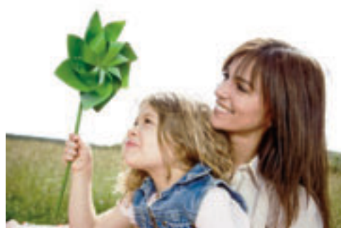
Encourage healthy living in Green for Life homes