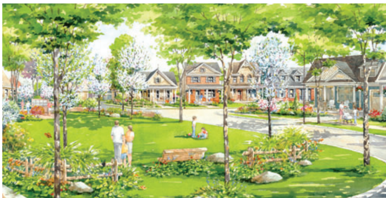
Spend some time with family at Peace Park in Avonlea

Nestled within the established community of Peterborough, Avonlea blends small-town charm with big-city services. Here, you can meet friends at the neighbourhood park, walk your dog under a canopy of trees and enjoy the sunset from your front porch. It's a family-oriented place, where people know their neighbours and life seems a little easier. Avonlea abounds with parks and ponds that welcome you home to a natural community with a wide array of trees and flowers of breathtaking colours, a natural attraction for birds and butterflies. Avonlea is also within walking distance to the local shops and schools of Peterborough. With a friendly lifestyle, set in a heartwarming natural community, it's no wonder that Avonlea brings a smile to so many faces.