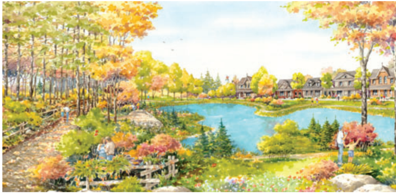
Avonlea Park and Pond, Cedar Fence Trail

Affordable, clean and safe Peterborough provides an exceptional home for families of all ages. From its humble beginnings in 1850, Peterborough has become a thriving city known for quality of life and natural beauty. Originally a canoe-building town, Peterborough is now the hub for east-central Ontario, with a diverse economy, quality health care, recreational opportunities and an established school system with several post-secondary institutions. Located one-hour from Toronto at the gateway to the Kawarthas, it boasts annual celebrations, such as the Summer Festival of Lights, as well as lush green spaces, numerous heritage sites and a vibrant arts community. Avonlea proudly names its streets in honour of Peterborough's veterans who fought for Canada such as Logan Lane and Bowen Drive and Peace Crescent.