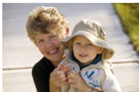
The perfect community for families of all ages