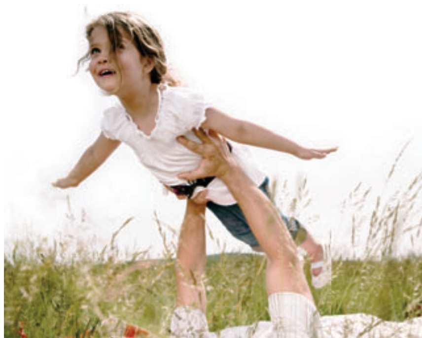
Enjoy the natural wonder of Avonlea