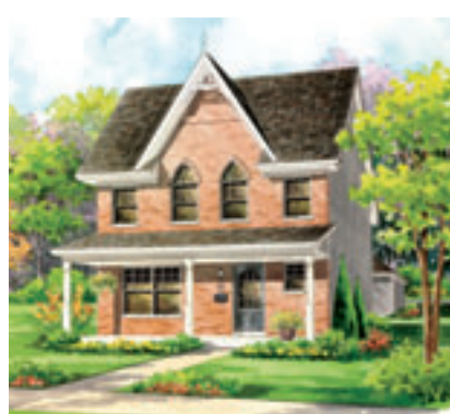
Beautiful Streetscapes with charming designs