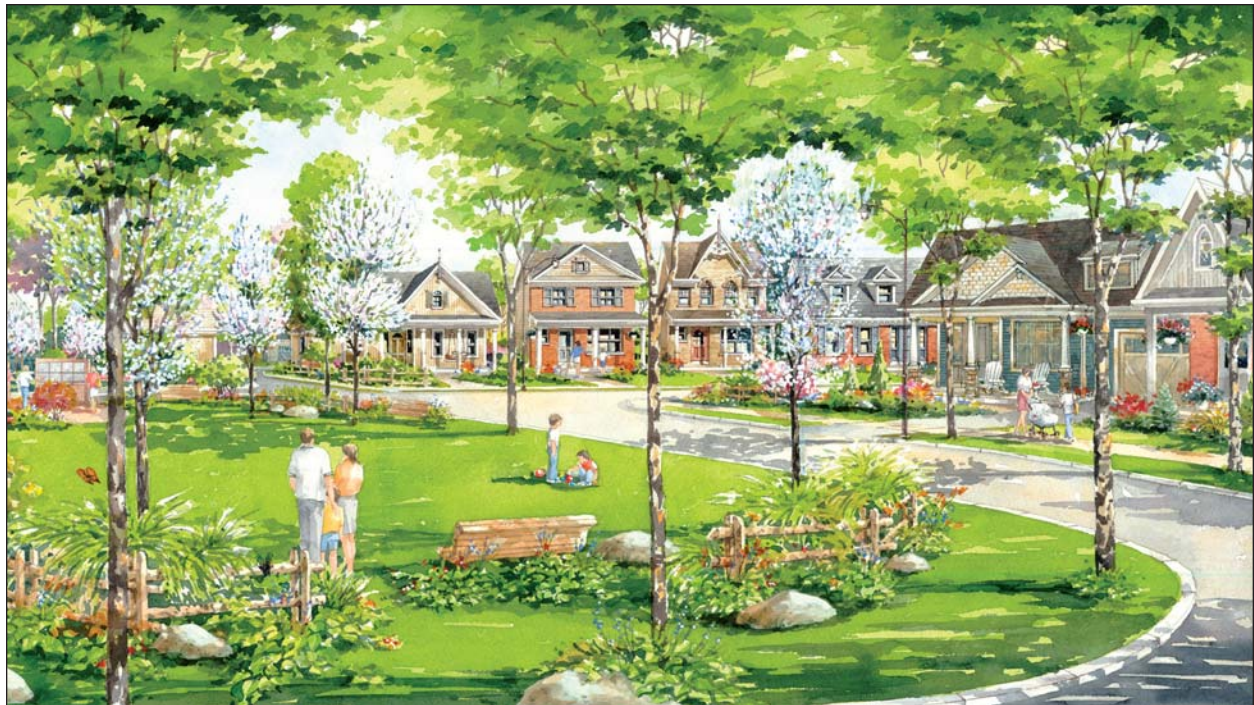
Peace Park in Avonlea